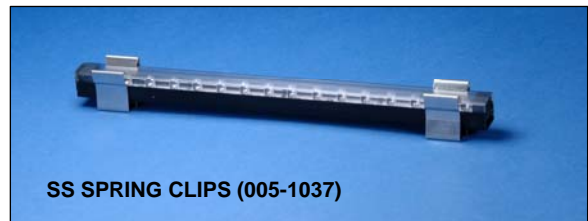
SS SPRING CLIPS (005-1037)