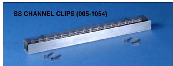
SS CHANNEL CLIPS (005-1054)