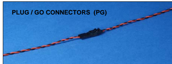
PLUG / GO CONNECTORS (PG)